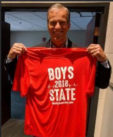
Senate Majority Leader John Thune