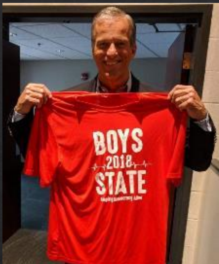
Senate Majority Leader John Thune